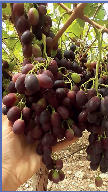
Table vineyard under a greenhouse. Bunch and wood ripening

Statia can be applied regularly throughout the vegetative-productive cycle of the crop, helping to keep the plant healthy and to contain the number of active ingredients used in defense strategies.